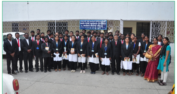
Permanent Lok Adalat