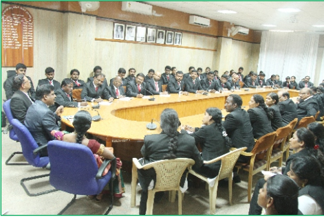
Permanent Lok Adalat