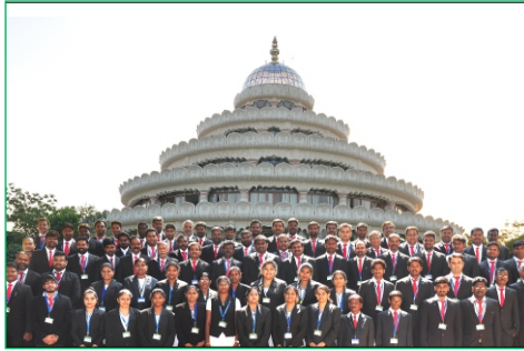
Ravi Shankar Ashram