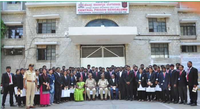
Central Prison - Bangalore