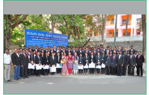
Women and Child Welfare Department